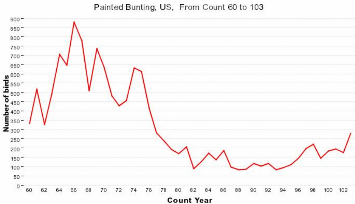
Figure 2. Data from National Audubon Society Christmas Bird Counts the non-breeding season. Year 60 = 1960, Year 102 = 2002.

Survey data from the non-breeding season from 43 years of the National Audubon Christmas Bird Counts (CBCs) from 1960 to 2003 also show a decline of the population throughout the United States (NAS 2004) (Figure 2).