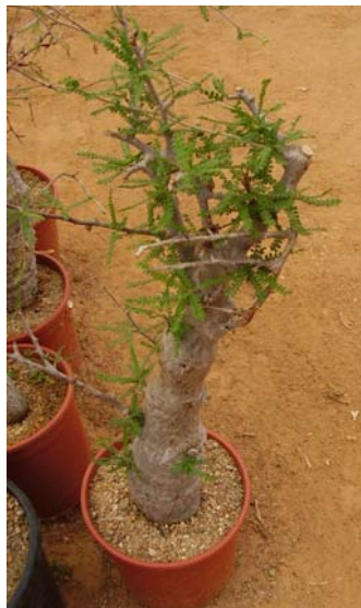
Photo: Operculicarya pachypus , in cultivation