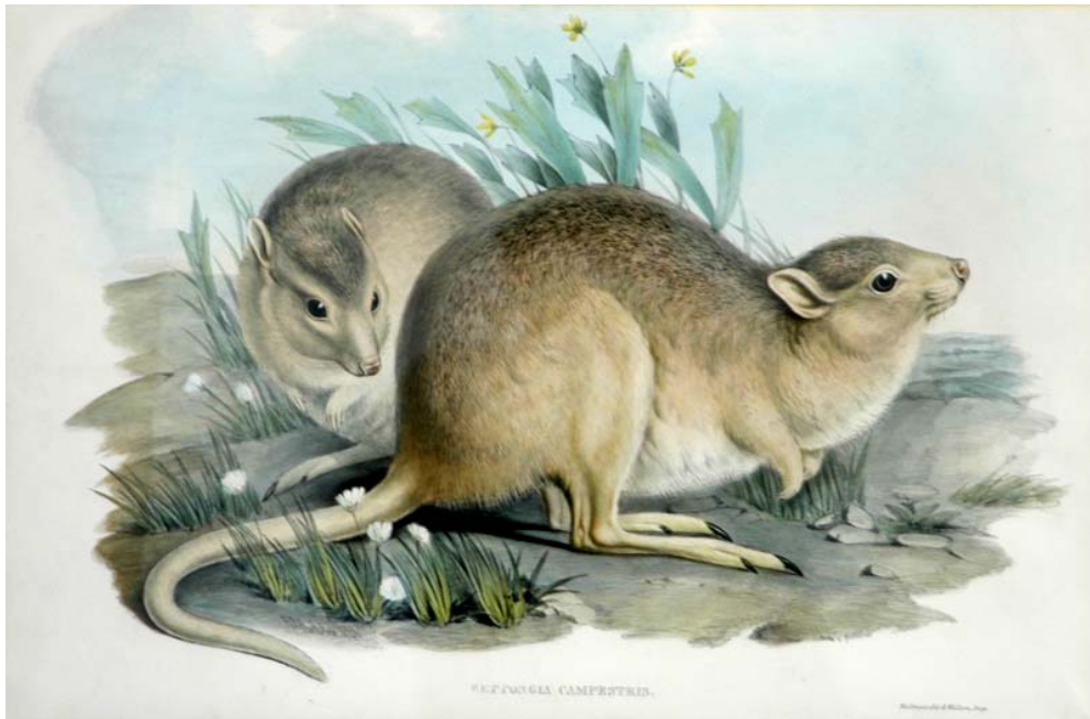
Figure 2 Desert rat kangaroo by John Gould (Richter, 1863).