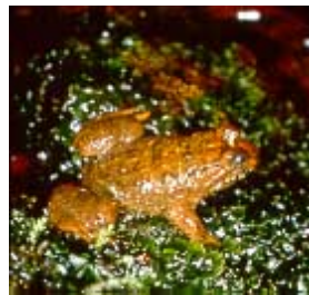
Figure 2 Northern gastric-brooding frog ( Rheobatrachus vitellinus ).

The northern gastric-brooding frog was a moderately large squat frog with males and females approximately 55.7 to 58 mm and 62.2 to 83 mm in length respectively. The dorsal surface was pale brown in colour with darker patches and a granular texture. Large skin projections were present on the upper eyelid. The ventral surface was smooth, white or brown in colour, with bright yellow to orange colouration on the abdomen and undersides of the limbs. The tympanum (ear cavity) was not visible externally. The snout was blunt, fingers free and the toes fully webbed (Mahony et al. , 1984; Cogger 2000).