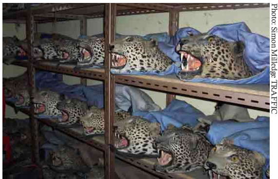
Mounted leopard skins in storage

Adopted at the WAZA Plenary Session of 20 November 2003 – 58th Annual meeting, held at San José, Costa Rica, 2003.